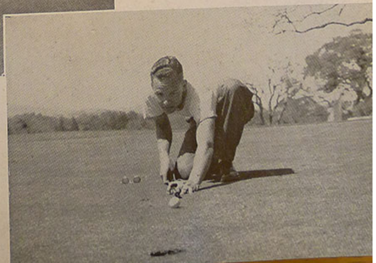
(Right) Golf ball in the side pocket.