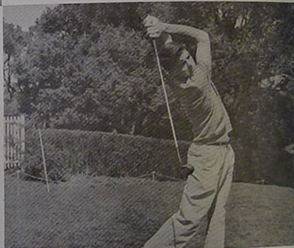
Straight down the fairway.