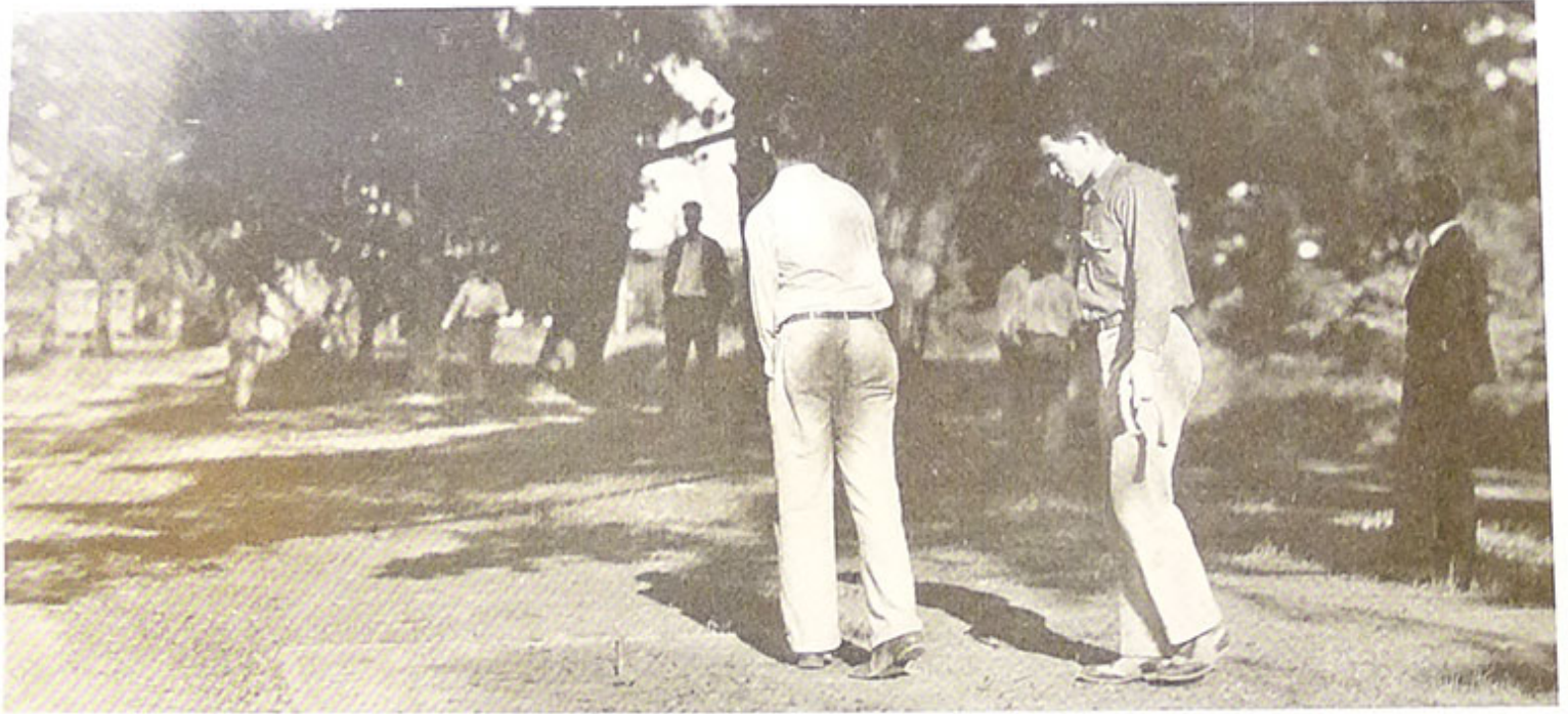
Barnyard golf in a wild moment