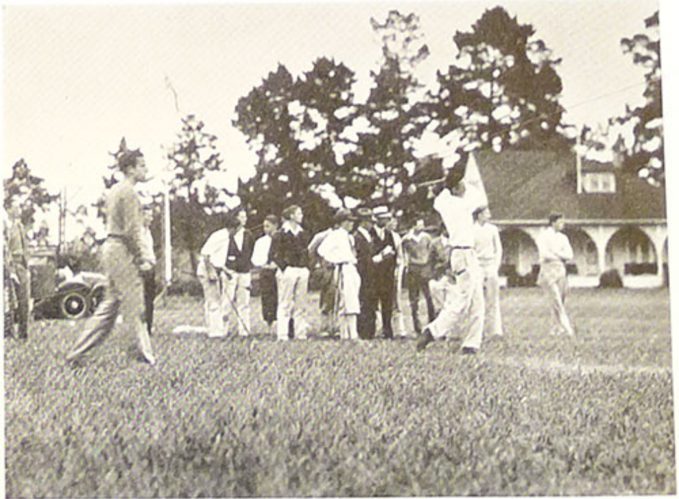
The University golf driving championship